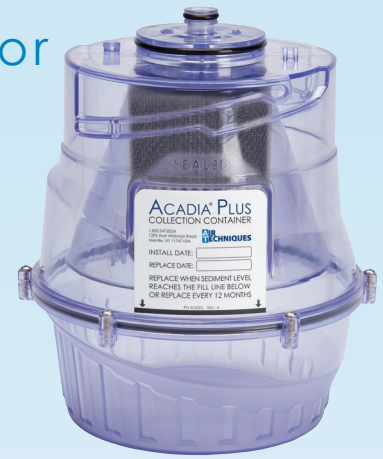
Acadia Plus Clear Filter