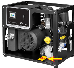
Mojave LT Monitor

V3M, V5M, V7M, 2V3M, 2V3MCT, 2V5M, 2V5MCT, 2V7M, 3V5M, 4V5M, V15M, 2V15M, 3V15M, 4V15M, MMC-M, V3, V5, V7, 2V3, 2V3CT, 2V5, 2V5CT, 2V7, 3V5, 4V5, V15, 2V15, 3V15, 4V15, MMC