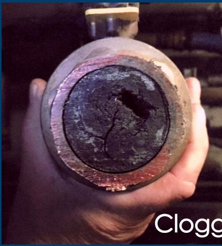
Clogged water line