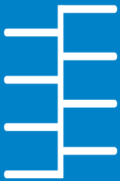
Mojave's Sound Reducing