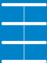
Competition's Linear vanes produce more noise